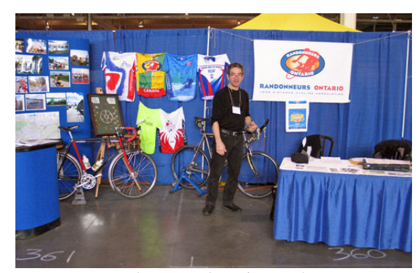
Randonneurs Ontario Booth

Thanks again to all volunteers for making this another successful bike show!