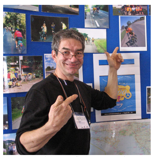
You might even find your own picture!