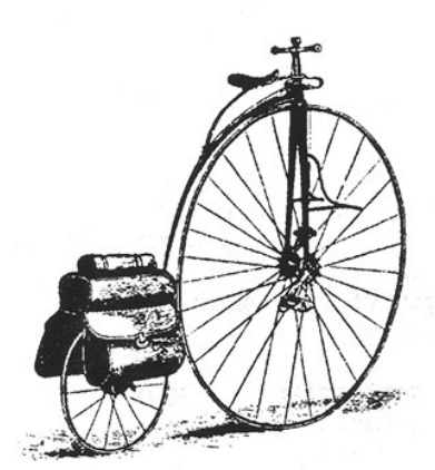
The "Gentleman's" Boadster,