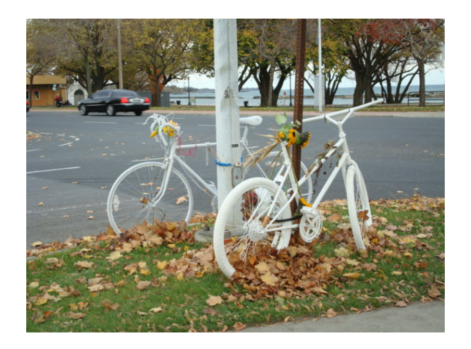
Ghost Bikes at the corner of Lakeshore Blvd and Colborne Lodge Dr, Toronto, where a cyclist was killed Sept. 26, 2010.